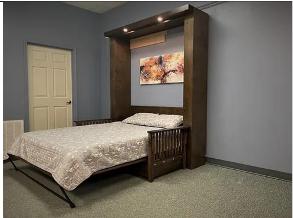
Barn Door Murphy Bed with Sofa Style 1519-0723