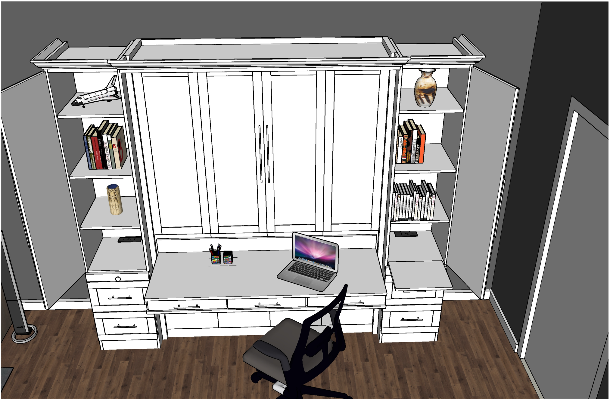
Bookcase Charging Station